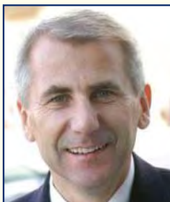
Mr Vygaudas Usackas, Minister for Foreign Affairs