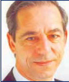
Mr Lawrence Gonzi, Prime Minister