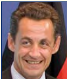
Mr Nicolas Sarkozy, President of the Republic