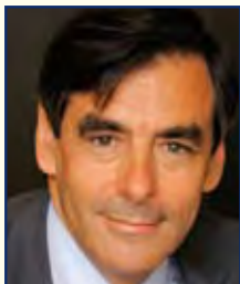
Mr François Fillon, Prime Minister