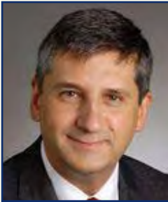
Mr Michael Spindelegger, Federal Minister for European and International Affairs