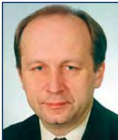
Mr Andrius Kubilius, Prime Minister