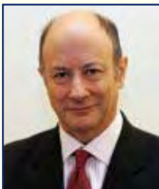
Mr Jan Vincent-Rostowski, Minister for Finance