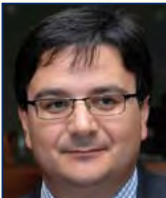
Mr Tonio Fenech, Minister for Finance, Economy and Investment