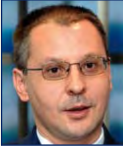
Mr Sergei Stanishev,