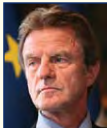
Mr Bernard Kouchner, Minister for Foreign and European Affairs