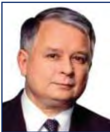
Mr Lech Kaczynski, President of the Republic